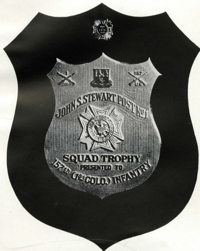
THE JOHN S. STEWART POST NO. 1, VETERANS OF FOREIGN WARS TROPHY. For competition among the Rifle Companies of the 157th Infantry.