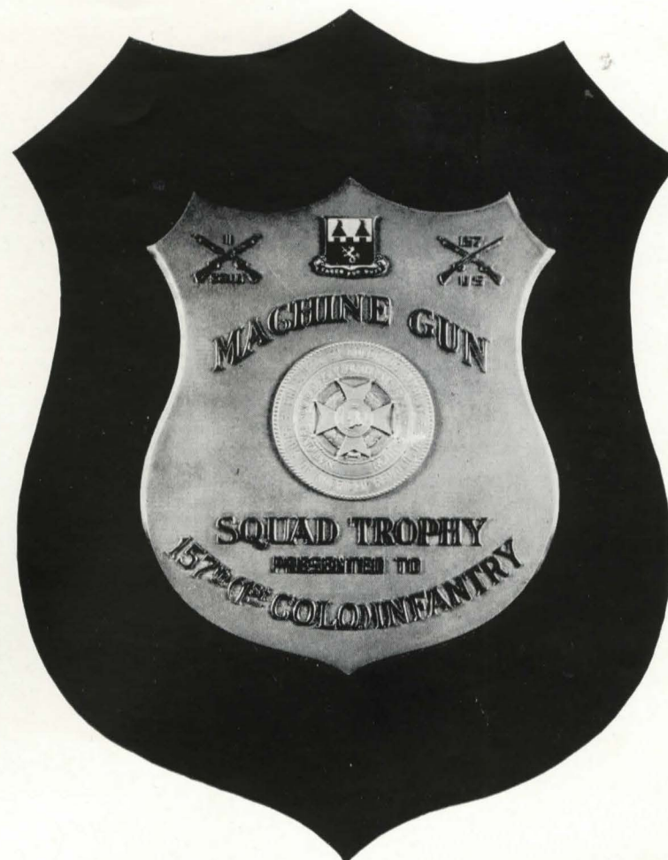
THE SONS OF THE AMERICAN REVOLUTION TROPHY. Presented by the Colorado Society Sons of the American Revolution for competition among the Machine Gun Companies of the 157th Infantry.